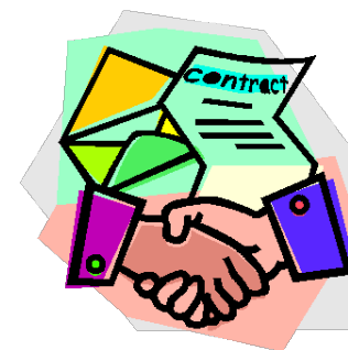
SDLT on leases